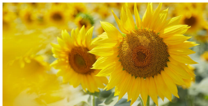
Sunflowers - the National Flower of Ukraine

Loving God, We pray for the people of Ukraine, for all those suffering or afraid, that you will be close to them and protect them.